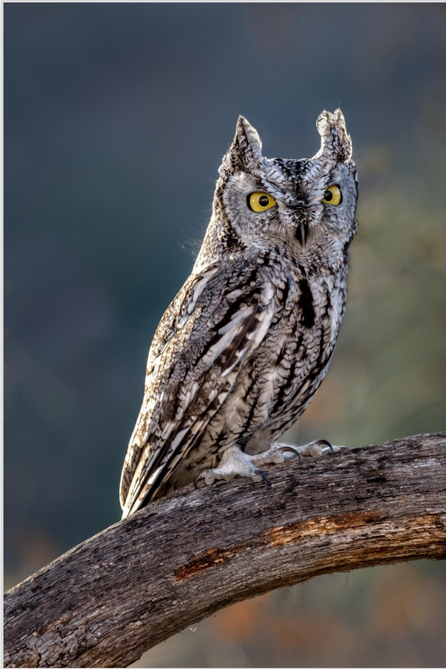
Smokey (Western Screech Owl)