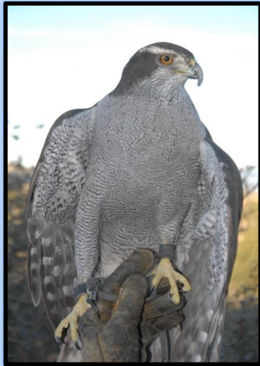
Shadow – Northern Goshawk