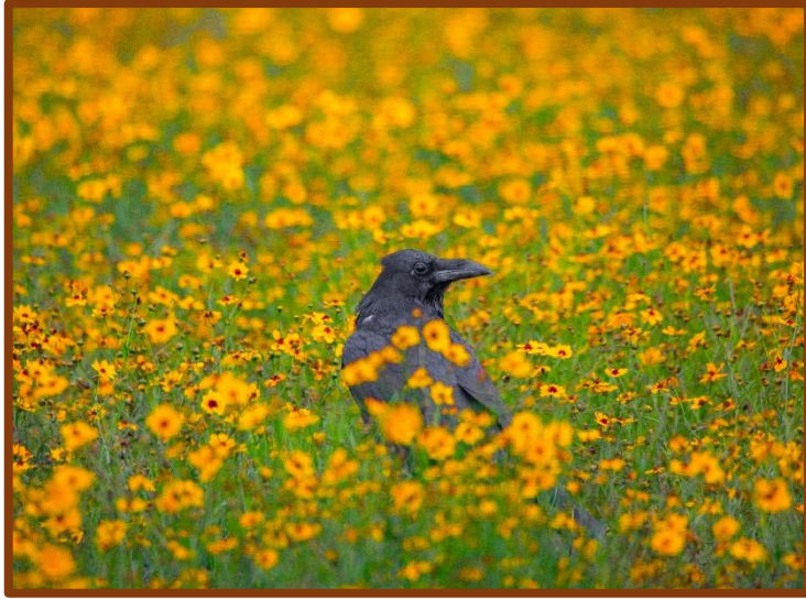
Common Raven By Gregory Griffin